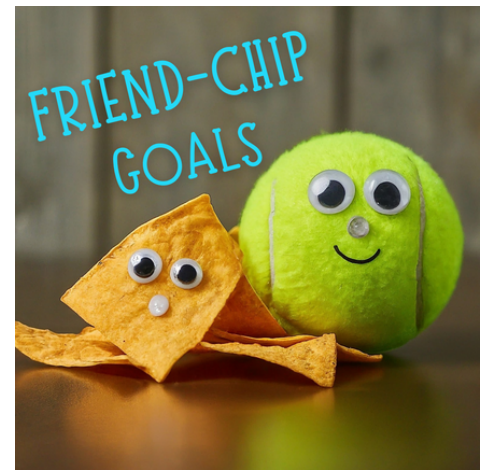
National Tortilla Chip Day